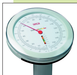
Dial with BMI