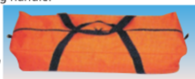
Carrying bag included

• 34689 VACUUM SPLINT KIT The set includes vacuum splints for arm (70x50 cm), leg (100x70 cm) forearm (50x30 cm) and a nylon bag. Produced with high quality materials, these splints allow perfect immobilization of the lower and upper limbs by removing the air inside. Equipped with an outside valve, to avoid troubles to the patient, and three velcro straps. Made of vinyl covered nylon, x-ray translucent. • 34095 ALUMINIUM PUMP - for vacuum splints and mattress Capacity: 0.75 l, rotating handle. Supplied with hose and fitting.